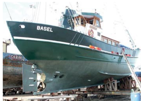
70ft steel fishing boat – Ireland.