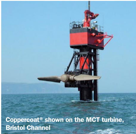
Coppercoat® shown on the MCT turbine, Bristol Channel

Anti-foul companies are rightly under increasing pressure to produce coatings that are environmentally sensitive as well as effective. Not only is Coppercoat® tin-free and fully compliant with all current anti-fouling legislation, including International Maritime Organisation (IMO) Resolution MEPC.102(48), but originating in the latest water-based epoxy technology allows the resin to be VOC (Volatile Organic Compound) free also. Consequently Coppercoat® gives off no toxic fumes or unpleasant smells and is certified for use by professionals and the general public alike. Furthermore, the cleaning solution for Coppercoat® is simply water.