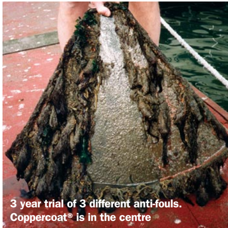
3 year trial of 3 different anti-fouls. Coppercoat® is in the centre

Coppercoat® uniquely provides lasting protection against marine fouling whilst secreting very low levels of biocide. With a leach rate of less than 50micrograms/cu/cm2 after 30 days, Coppercoat® complies with the requirements of even the most tightly controlled locations, such as the states bordering the Baltic and, in the USA, California. Consequently a vessel treated with Coppercoat® can sail freely in all waters of the World, and given the hard-wearing longevity of the coating, the dream of circumnavigating the globe on a single treatment of anti-foul is now a reality.