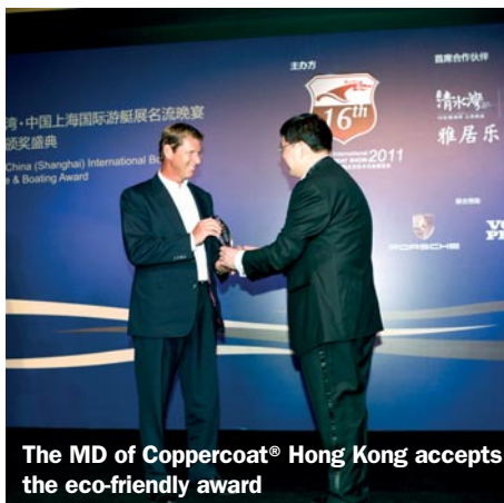
The MD of Coppercoat® Hong Kong accepts the eco-friendly award

In 2011 we were delighted to receive the “Most Eco-Friendly Business” Award at the China (Shanghai) International Boat Show, making Coppercoat® an award-winning and responsible choice.