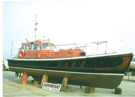
42ft GRP pilot vessel – UK.