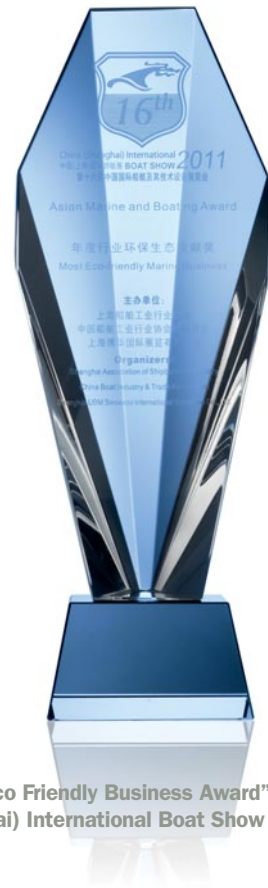
“Most-Eco Friendly Business Award” China (Shanghai) International Boat Show 2011

For those looking to minimise the environmental impact of their anti-foul, Coppercoat® can provide the solution.