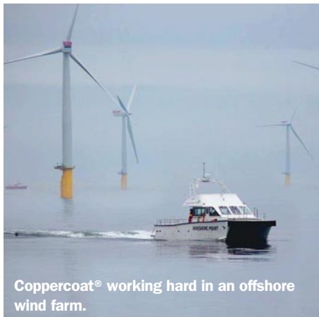
Coppercoat® working hard in an offshore wind farm.