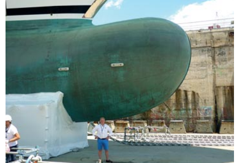
410ft steel megayacht – Greece.

Hard-wearing Coppercoat® gives longer service intervals, allowing vessels to stay in-water and stay working, with obvious economic benefits.