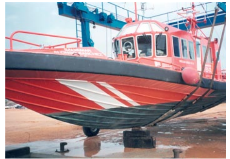
36ft aluminium patrol boat – Spain.