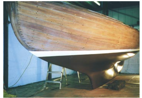
Wooden XOD sprayed for racing finish.