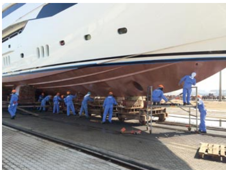
Above Coppercoat® can also be applied by spray.

Coppercoat® is suitable for DIY application by roller and by being non-conductive can be used (with the appropriate primer) on all surfaces including GRP, cast iron, steel, wood, ferrocement and aluminium.