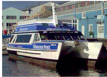
50ft composite passenger ferry – New Zealand.